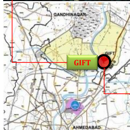
GIFT location Map